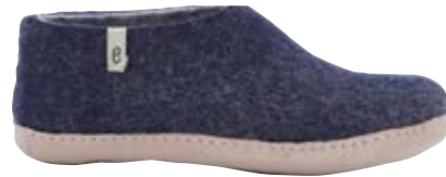
• Blue •