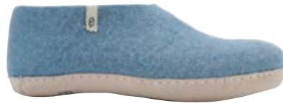
• Light Blue •