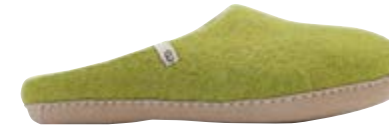
• Lime •