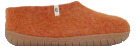
• Clay •