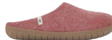
• Dusty Rose •