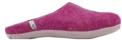
• Cerise •