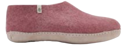
• Dusty Rose •