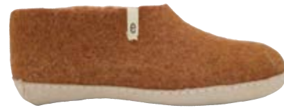
• Chestnut •