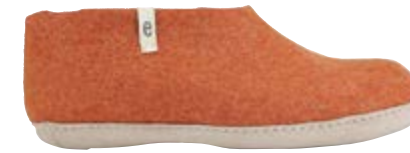
• Clay •