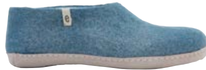
• Sea Blue •