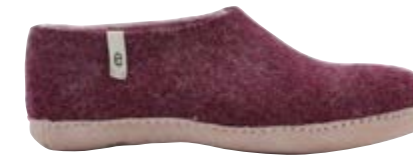
• Bordeaux •