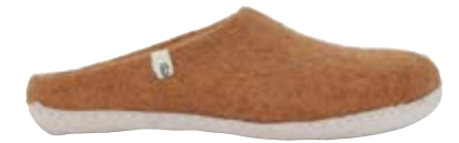
• Chestnut •