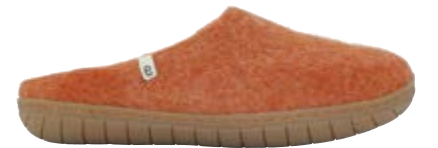
• Clay •