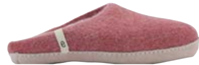
• Dusty Rose •