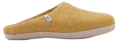
• Mustard •