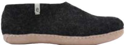
• Black •