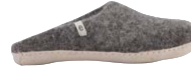
• Natural Brown •