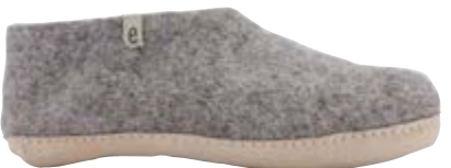
• Natural Grey •