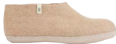
• Beige •