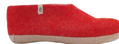
• Rusty Red •