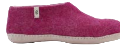
• Cerise •