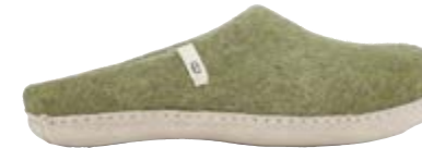
• Moss Green •