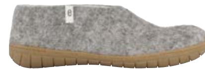
• Natural Grey •