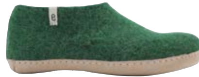
• Green •