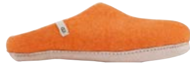
• Orange •