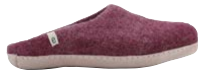
• Bordeaux •