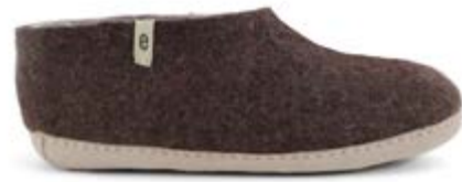
• Chocolate •