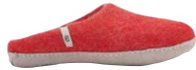
• Rusty Red •