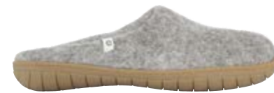
• Natural Grey •