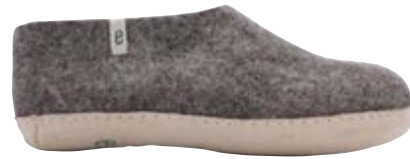
• Natural Brown •