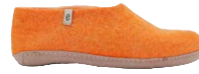
• Orange •