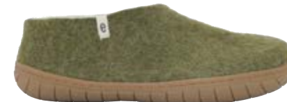
• Moss Green •