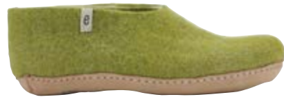
• Lime •