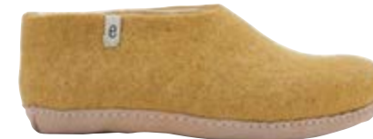
• Mustard •