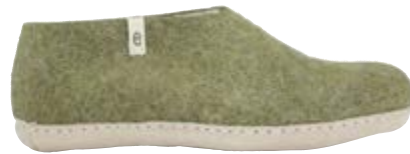
• Moss Green •